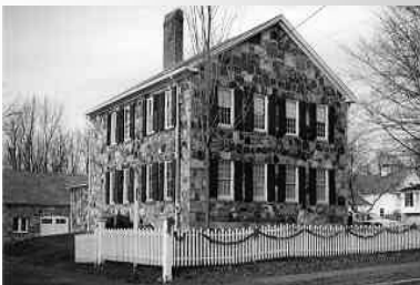
"THE STONE HOUSE MUSEUM"

Belchertown Historical Association Belchertown, Massachusetts 1903—2012