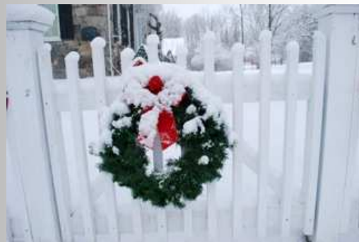
An October 29, 2011 snowstorm brought most events to a standstill in Belchertown for over a week!